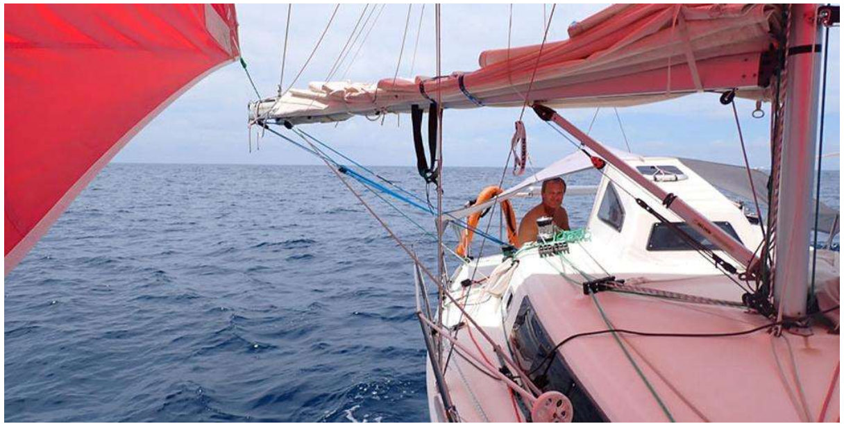
The log of this eleven-year circumnavigation: over 50,000 nautical miles, 10,000 hours of sailing and 600 anchorages.

By Édith Anselme Published 22/11/2024 on www.sudouest.fr (Translated from French by Carina Juhhova)